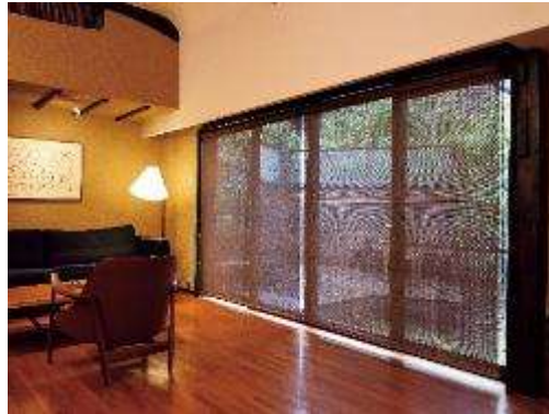
36 textures & roll-up-down mechanisms