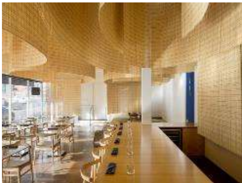
Materials for huge interior spaces